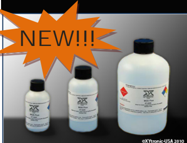
Rosin Flux 800

Available in 2oz / 4oz / 16oz / 1 Gallon / XY-RF800LF128