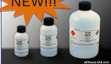
No-Clean Liquid Flux EF 8300