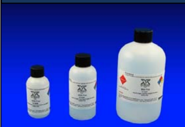
Rosin Flux 800

Available in 2oz / 4oz / 16oz / 1 Gallon / XY-EF6100RLF2