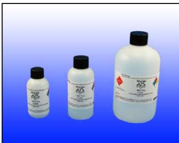
Rework Flux XY-EF6100RLF2