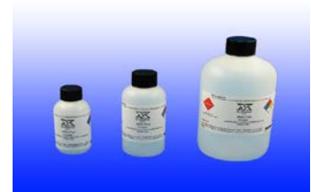
XYtronic Fluxes (RMA, WS, Rosins, No Cleans)