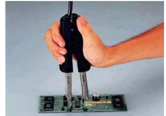
TWZ-70 SMT Tweezers This optional feature is specially designed for SMD chips, SOT, Flat pack IC's, and surface mount electrolytic capacitors.