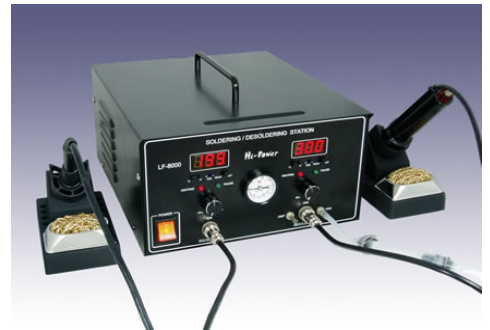
LF 8000 Solder/De-solder Station Optional SMT Tweezer and Hot Air Pencil