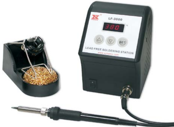
The XYtronic LF-3000 High Frequency Soldering Station

For additional information or ordering assistance please call toll free 877-700-6085 to speak with a XYtronic Soldering Specialist today!